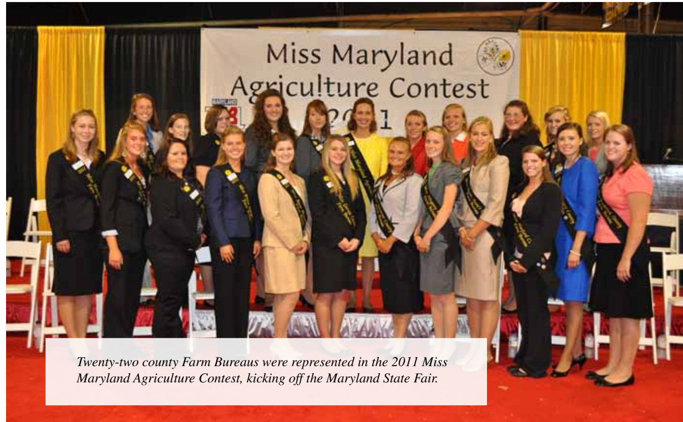
Twenty-two county Farm Bureaus were represented in the 2011 Miss Maryland Agriculture Contest, kicking off the Maryland State Fair.