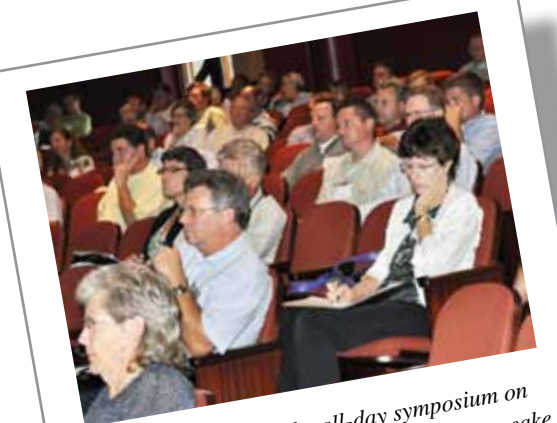
About 200 attended the all-day symposium on septic systems and future growth at Chesapeake College in Easton.