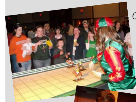
Casino Night fun!